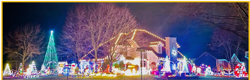
Bellbrook Light Fight Winner, The Barton Family at 4101 Amy Brooke Circle