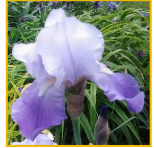
The Wright Flyer iris